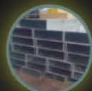
C'S Z'S AND ANGLES