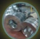
CUSTOM ROLL FORMING